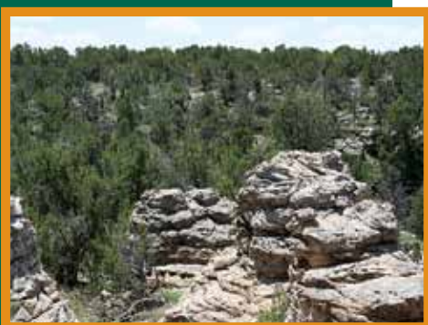
Figure 24: Piñon-juniper forests are often composed of continuous fuels. Creating clumps of trees with large spaces in between clumps will break up the continuity.

Note: This publication does not address high-elevation spruce-fir forests. For information on this forest type, please contact your local CSFS district office.