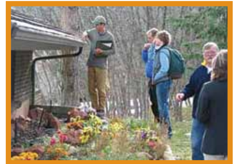
Figure 27: Sharing information and working with your neighbors and community will give your home and surrounding areas a better chance of surviving a wildfire.