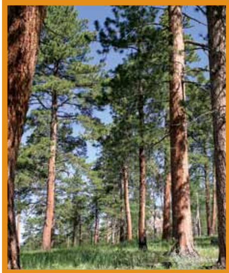
Figure 20: This ponderosa pine forest has been thinned, which will not only help reduce the wildfire hazard, but also increase tree health and vigor.