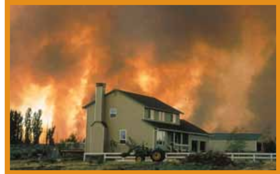
Figure 1: Firefighters will do their best to protect homes, but ultimately it is the homeowner's responsibility to plan ahead and take actions to reduce fire hazards around structures.

In this guide, you'll read about steps you can take to protect your property from wildfire. These steps focus on beginning work closest to your house and moving outward. Also, remember that keeping your home safe is not a one-time effort – it requires ongoing maintenance. It may be necessary to perform some actions, such as removing pine needles from gutters and mowing grasses and weeds several times a year, while other actions may only need to be addressed once a year. While